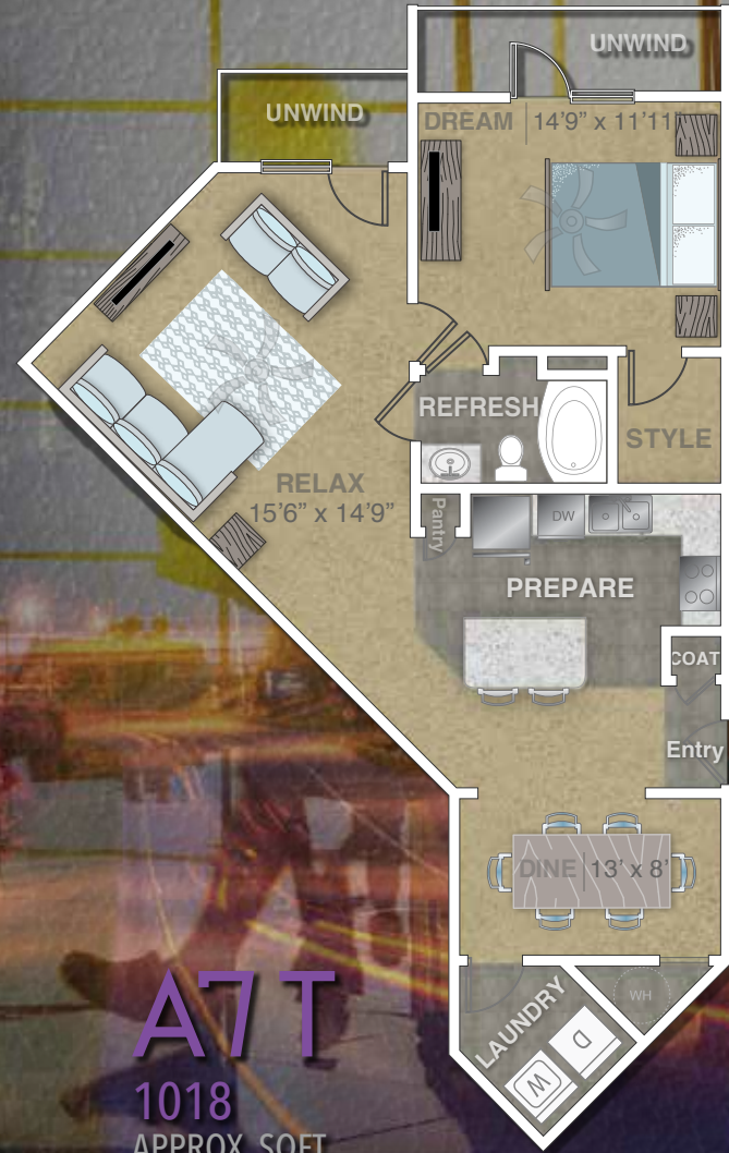
A7T 1018 APPROX. SQFT