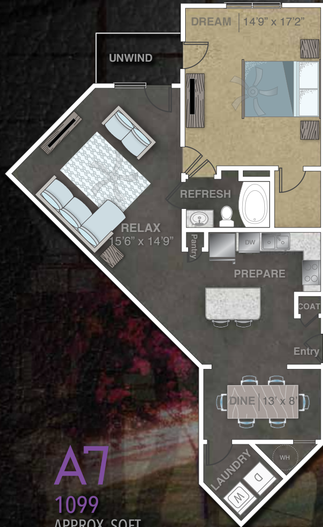
A7 1099 APPROX. SQFT